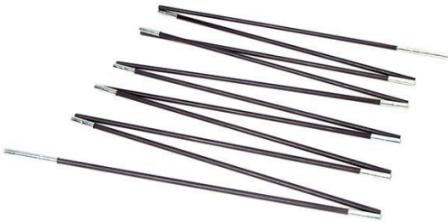
a. 2 fibre glass pole sets