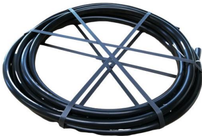
b. 2 plastic hoses