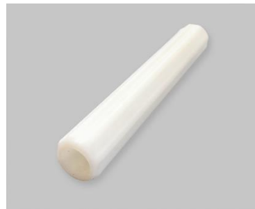
e. 2 plastic filler sleeves